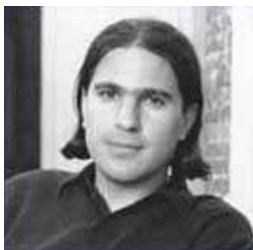
Nima Arkani-Hamed Professor of Physics Harvard University